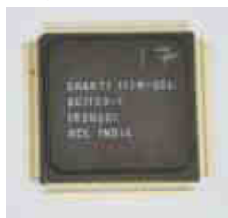
INDIA'S FIRST MICROPROCESSOR!